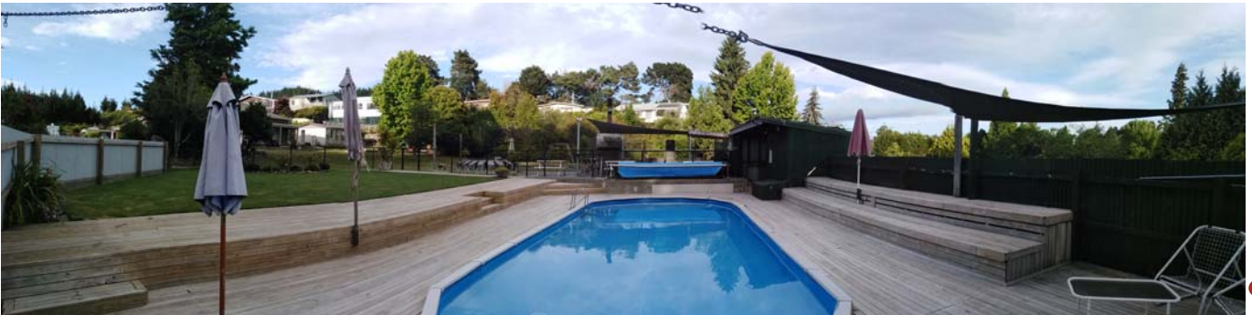
There's a swimming pool of course - with plenty of shade options - and it's heated! (Well, warmed!)