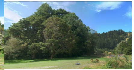
At Marble Hills they're nice for camping