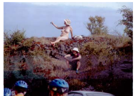
but hasn't reached the bystanders yet

This year (hopefully) sees an inaugural bike ride in Waihi (pg 2 for postponement details), as we approach the 20th anniversary of these events in New Zealand. We have seen them occur in Auckland, Hamilton, Hawkes Bay, Takaka and Otago so far. The World Naked Bike Rides have been very useful for educating the police on the ( non- )laws in New Zealand, and also around 'innocent nudity' in public places.