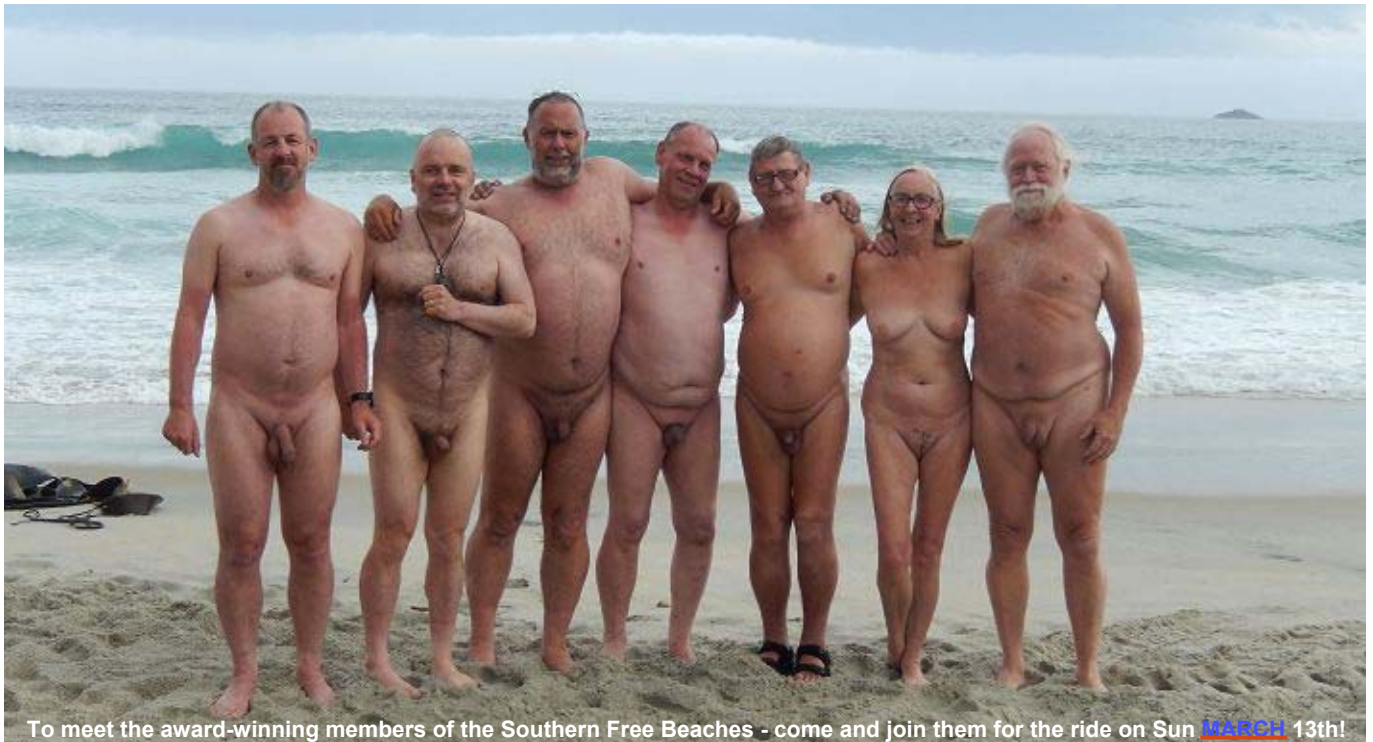
To meet the award-winning members of the Southern Free Beaches - come and join them for the ride on Sun MARCH 13th!

As we made our way down to the water the rain stopped until we had finished our swim which was great and it turned out to be not a bad evening so thanks again to everyone who showed up yet again.