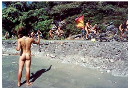
It's an obvious camera magnet