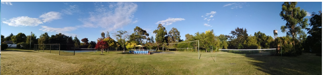
Pineglades has extended their variety well beyond pines (and glades) to add colour to their scenery