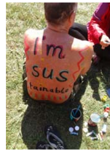
Body painting is becoming more elaborate...