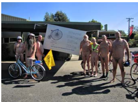
Waitati Southern Free Beaches is still spreading the message, this MARCH!