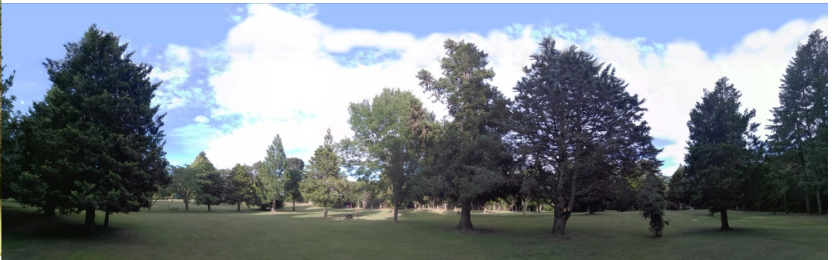
In Nelson they distract the golfers