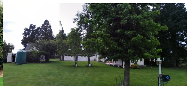
The South Canterbury Club has even more trees than meet the eye here