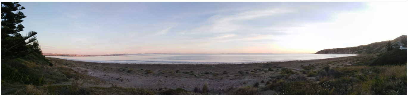
On our final day in the South Island we camped at Marfells Beach, to be greeted by this view at dawn, before a leisurely trip to the ferry

Unfortunately on this trip Margaret and I were not able to make it to our original destination: Southern Naturally, for various reasons, like weather and travelling time but that is of course a fine excuse for having another trip one day! Each place has its unique charm, but like many other North Islanders, we certainly missed being able to stop over at Wainatur, going to and from the ferry!