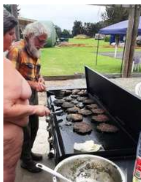
Food always makes the occasion; Paua Patties