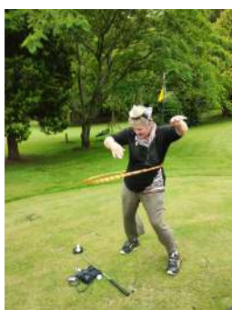
Nelson Naturist Park