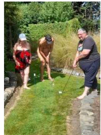
Golf along the rock paths was a 'hit'