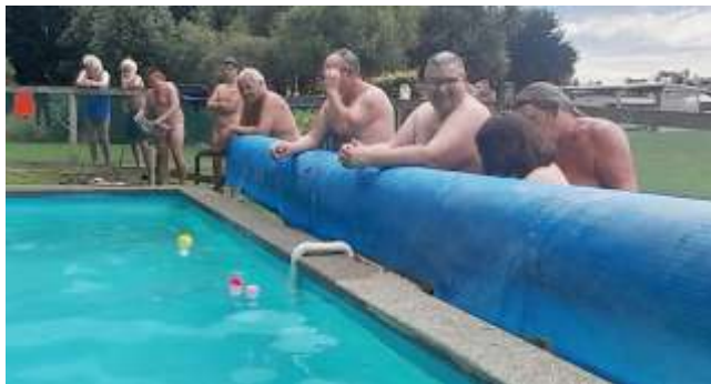
Rolling up for a turn.

The hot day drew crowds to the pool, some having to retrieve items from the pool floor of hit ducks bobbing on the surface. To score a duck had to be hit with a ping-pong ball.