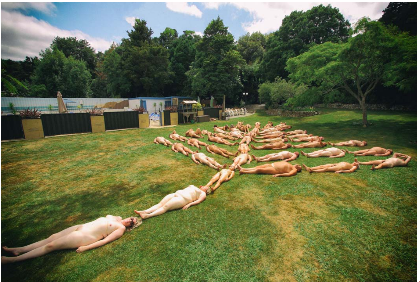
Two views of the silver fern created by (more or less) brown bodies on (more or less) green grass...