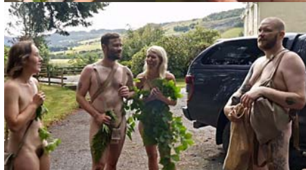
Are the producers rather cautious because they're in Scotland? (The English 'Met' were reviewing their nudity rules around this time)