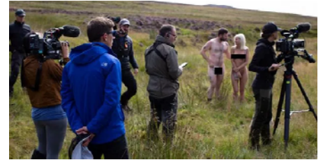
The documentary crew of 6. Censorship courtesy of mirror.co.tv - why, I wonder?

But being starkers does bring extra difficulties – being bitten by insects, trying to walk across rough terrains while avoiding stinging nettles and coping with the climate – even if it was filmed in the Scottish summer.