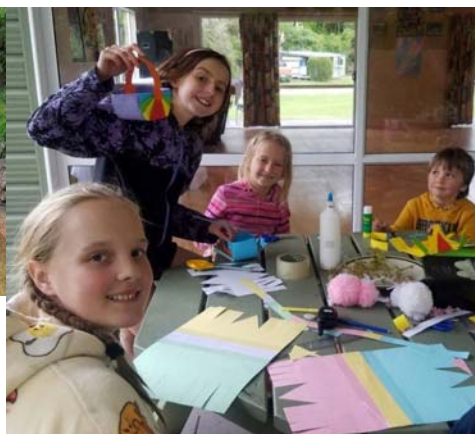
Not all the kid's activities were indoors - left and right, especially given the availability of a nice warm stream at Rotota!